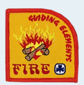
Guiding Elements Fire