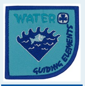
Guiding Elements Water